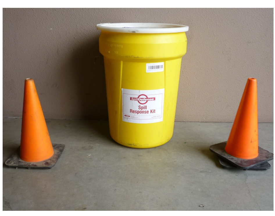
Contact Department of Ecology