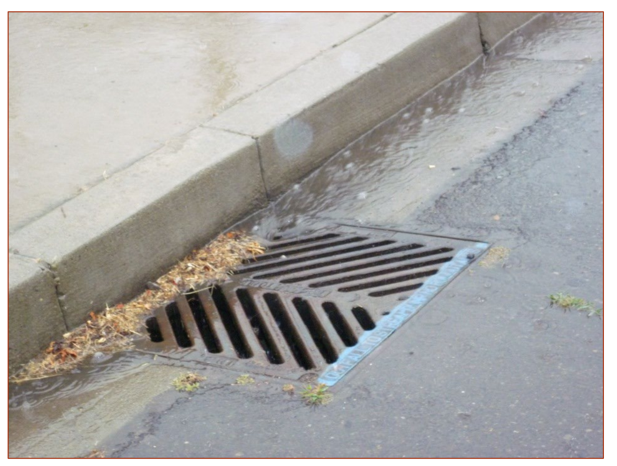
Remember Only Rain Down The Drain